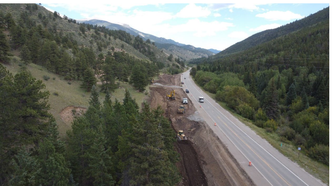
Grading and excavation on the west side of CO 285 near Grant.